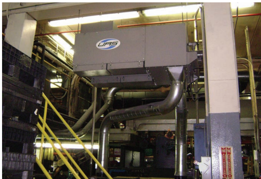
A cartridge dust collector hangs from the plant's ceiling above a roller mill and provides clean cooling air to the mill's two fan-cooled motors.