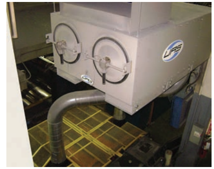
The dust collector's removable doors allow an operator easy access for replacing cartridge filters.

"The dust collector has a fairly deep, but short, clean-air plenum, so that the